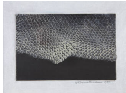
Title: Wave Movement (Collage 88) Date: 1983 Medium: Acrylic on Card on Hardboard