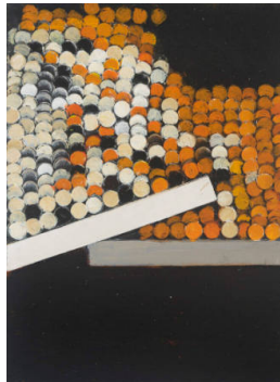
Title: Tilted Construction (Orange, Black and White) Date: 1982-85 Medium: Oil and Acrylic on Card on Hardboard