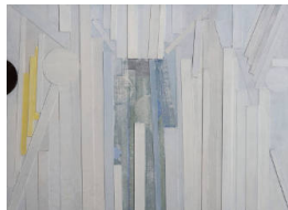
Title: To Eros Date: 1984-1985 Medium: Acrylic on Card on Hardboard