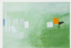
Title: Encounter Series 2 (Green) Date: 1987 Medium: Acrylic on Paper on Hardboard