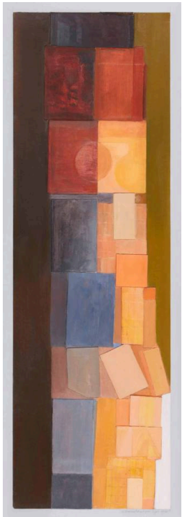
Title: Warbeth I Date: 1985 Medium: Acrylic on Card on Hardboard