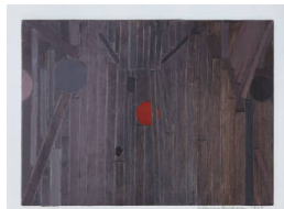
Title: Collage 122 Date: 1983 Medium: Oil and Acrylic on Card on Hardboard