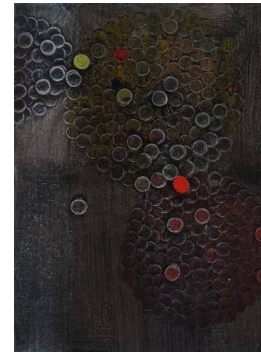
Title: Spheric Theme 2 Date: 1982 Medium: Oil and Acrylic on Card on Card