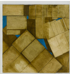
Title: Warbeth 7 Date: 1985 Medium: Acrylic on Paper on Hardboard