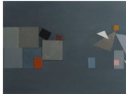
Title: Constructed Painting No. 10 Date: 1987 Medium: Acrylic on Board on Board