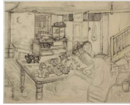
Title: Toy Workshop, The Digey, St Ives Date: 1944 - 5 Medium: Pencil and Crayon on Paper