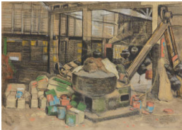
Title: Island Factory St Ives Series (Camouflage No.1) Date: 1944 Medium: Pastel on Paper