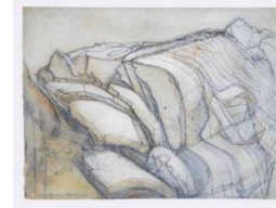
Title: Glacier, Switzerland Date: 1949 Medium: Mixed Media on Paper