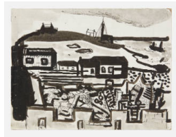
Title: Box Factory St Ives [sketch] Date: 1948 Medium: Pen, Ink and Gouache on Board