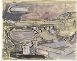
Title: Scilly Islands (Landscape with Cows) Date: 1940s Medium: Off-set Drawing and Gouache on Paper