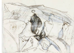
Title: Glacier Study with Guide Cutting Steps Date: 1949 Medium: Off-set Drawing and Wash on Paper