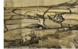
Title: Cornish Landscape Date: 1940s Medium: Pen, Ink and Wash on Paper