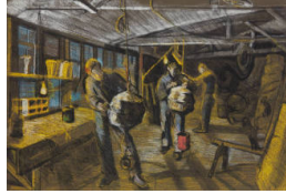
Title: Island Factory St Ives (Camouflage No.2) Date: 1944 Medium: Pastel on Paper