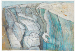
Title: [Glacier study] Date: 1949 Medium: Mixed Media on Paper