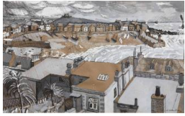
Title: Storm Brewing Date: 1944 Medium: Pen, Ink and Gouache on Paper