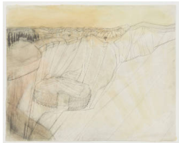
Title: Chiusure May 1955 Date: 1955 Medium: Pencil and Tempera on Paper