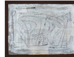
Title: Glacier Nocturne Date: 1950 Medium: Monotype and Oil on Board