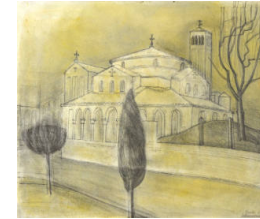
Title: Torcello [21 June] Date: 1954 Medium: Pencil and Wash on Paper