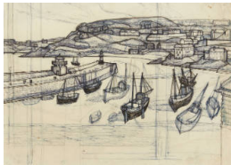
Title: St Ives from the Gap Date: 1950 Medium: Pen and Ink on Paper