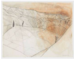
Title: Evening, July [11th July, Chiusure] Date: 1954 Medium: Pencil and Tempera on Paper