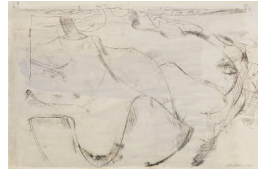
Title: White Rocks Date: 1953 Medium: Off-set Drawing and Other Medium on Paper