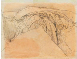
Title: Canyons Palinuro Campagna Date: 1955 Medium: Pencil and Tempera on Paper