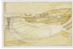
Title: St Martins Lower Town I Date: 1951 Medium: Pencil and Oil on Hardboard