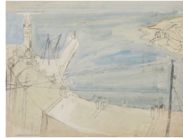
Title: Porthleven from Tye Rock (Study for St Ives Festival Painting) Date: 1951 Medium: Off-set Drawing and Gouache on Paper