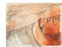
Title: Palinuro Campagna Date: 1955 Medium: Pencil and Tempera on Paper