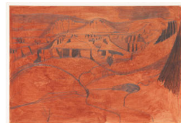
Title: Palinuro, Campagna Date: 1955 Medium: Gouache and Pencil on Paper