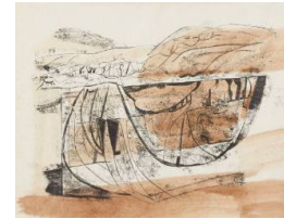
Title: Clay Working, Chiusure Date: 1954 Medium: Off-set Drawing and Tempera on Paper