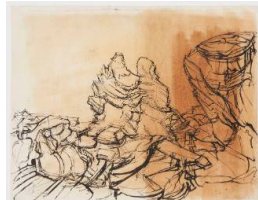
Title: Rocks, Formentera Date: 1958 Medium: Pen, Ink and Wash on Paper