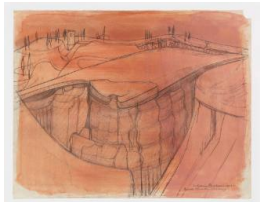
Title: Monte Olivetti, Tuscany Date: 1954 Medium: Pencil and Tempera on Paper