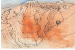
Title: Red Canyon Palinuro Campagna [27 April] Date: 1955 Medium: Pencil, Tempera and Gouache on Paper