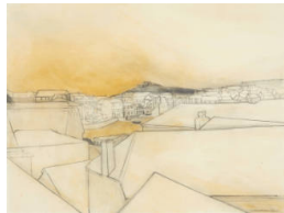
Title: St Ives No. 3 Date: 1984-1985 Medium: Charcoal, Oil and Conte on Paper