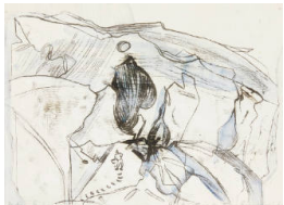
Title: Glacier Study with Guide Cutting Steps Date: 1949 Medium: Off-set Drawing and Wash on Paper