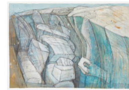
Title: [Glacier study] Date: 1949 Medium: Mixed Media on Paper