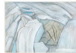
Title: End of the Glacier Upper Grindelwald Date: 1949 Medium: Gouache and Pencil on Paper