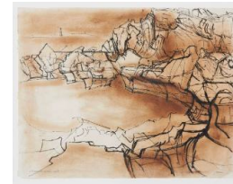
Title: Formentera Date: 1958 Medium: Pen, Ink and Wash on Paper