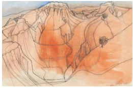
Title: Red Canyon Palinuro Campagna [27 April] Date: 1955 Medium: Pencil, Tempera and Gouache on Paper