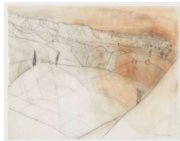
Title: Evening, July [11th July, Chiusure] Date: 1954 Medium: Pencil and Tempera on Paper