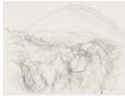
Title: Volcanic Island (near Montana del Fuego) Date: 1989 Medium: Pencil on Paper