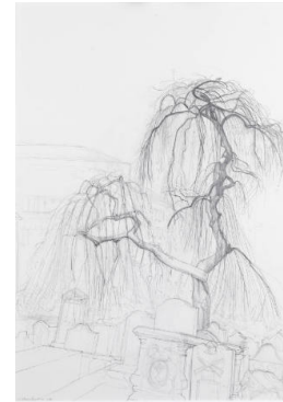
Title: Weeping Ash, The Hauff, Dundee Date: 1980 Medium: Pencil on Card