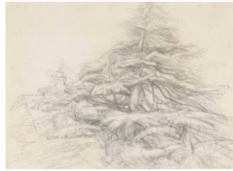
Title: Deodar Tree Date: 1980 Medium: Pencil on Paper