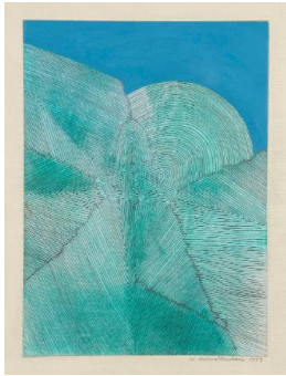
Title: Glacier Knot Date: 1979 Medium: Pen, Ink and Mixed Media on Board