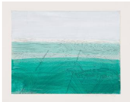
Title: Glacier Field Date: 1978 Medium: Mixed Media on Card