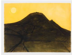
Title: Black Silence I, Maguez (Yellow) Date: 1990 Medium: Gouache on Paper