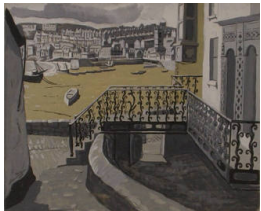
Title: Railings Date: 1948 Medium: Gouache on Board