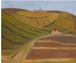
Title: [Untitled Landscape] Date: 1940s Medium: Acrylic and Oil on Hardboard