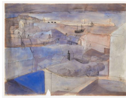
Title: St Ives Date: 1947 Medium: Off-set Drawing and Gouache on Paper