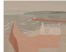
Title: White Cottage Cornwall Date: 1944 Medium: Gouache on Paper