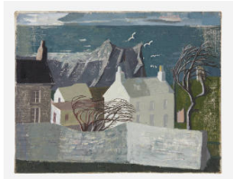
Title: Gurnards Head [No. 1] Date: 1947 Medium: Oil on Canvas