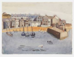
Title: St Ives Harbour Date: 1940 Medium: Gouache on Paper