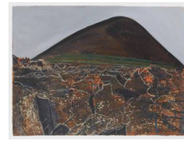
Title: La Geria, Lanzarote No. 3 Date: 1989 Medium: Acrylic on Paper