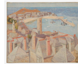
Title: View of St Ives Date: 1940 Medium: Oil on Canvas