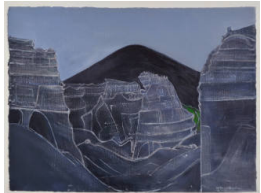
Title: Quarry Nr Teseguite, Lanzarote Date: 1989 Medium: Acrylic on Paper