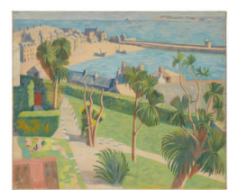
Title: St Ives Date: 1941 Medium: Oil on Canvas