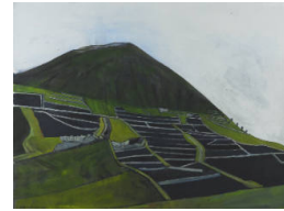
Title: Lanzarote Series Date: 1990 Medium: Acrylic on Paper