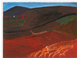
Title: Lanzarote Series Date: 1991 Medium: Gouache on Paper