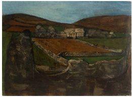
Title: Tregarthen Farm, Zennor Cornwall Date: 1948 Medium: Oil