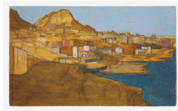
Title: [Monreale, Sicily] Date: c.1955 Medium: Oil and Pencil on Board