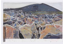
Title: [Lava Forms, Lanzarote] Date: 1990 Medium: Gouache on Paper