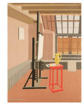
Title: Studio Interior (Red Stool, Studio)