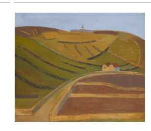
Title: [Untitled Landscape] Date: 1940s