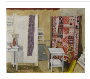
Title: Studio Interior 1947 II Date: 1947 Medium: Oil on Canvas