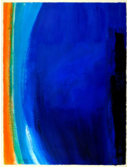
Title: Flyover, Ocean Series No. 2 Date: 2002 Medium: Acrylic on Paper