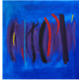
Title: Boogie Date: 2003 Medium: Acrylic on Canvas