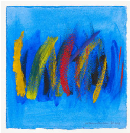
Title: [Untitled] Date: 2003 Medium: Acrylic on Paper