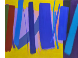
Title: Five Blues Date: 2000 Medium: Acrylic on Canvas