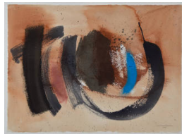
Title: Untitled (April) Date: 2001 Medium: Acrylic on Paper