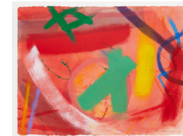
Title: Millennium Celebration Date: 2000 Medium: Acrylic on Paper