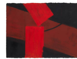
Title: Maroon and Orange on Black Date: 2000-01 Medium: Acrylic on Paper