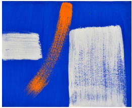
Title: White and Orange on Blue Date: 2003 Medium: Acrylic on Canvas