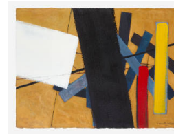
Title: Construction III Date: 2002 Medium: Acrylic on Paper