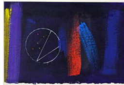
Title: A Song of Night Date: 2003 Medium: Acrylic on Paper