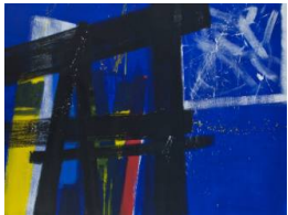
Title: Ultramarine II Date: 2000 Medium: Acrylic on Canvas