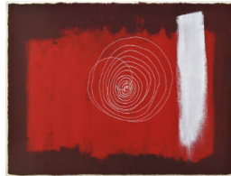
Title: Untitled (White Flash) [Walkabout Time Motif] Date: 2003 Medium: Acrylic on Paper