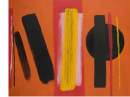
Title: Blaze Date: 2003 Medium: Acrylic on Canvas