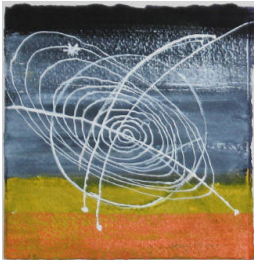
Title: Untitled [Walkabout Time Motif] Date: 2002 Medium: Acrylic on Paper