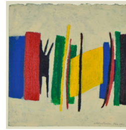
Title: Untitled 41/03/A Date: 2003 Medium: Acrylic on Paper