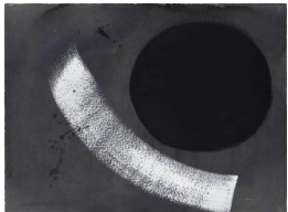
Title: Untitled (Grey) Date: 2001 Medium: Acrylic on Paper