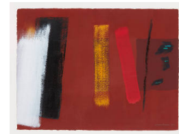
Title: Enter White and Black on Oxide Red Date: 2001 Medium: Acrylic on Paper