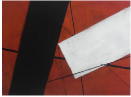
Title: Construction 2 (Red & Black) Date: 2002 Medium: Acrylic on Paper