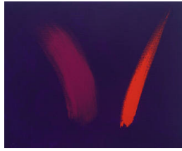
Title: Two Reds on Purple Date: 2003 Medium: Acrylic on Canvas