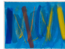
Title: Untitled, 57/00 Date: 2000