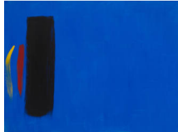
Title: Wait Date: 2003 Medium: Acrylic on Canvas