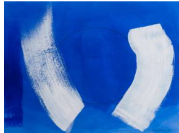
Title: Easter Date: 2000 Medium: Acrylic on Paper