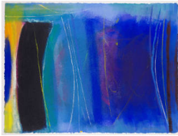
Title: Ocean III Date: 2000 Medium: Acrylic on Paper