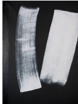
Title: Vertical Movement (Easter Series) White on Black Date: 2001 Medium: Acrylic on Canvas