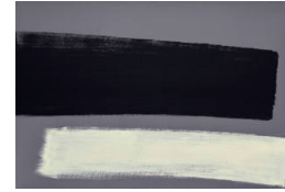
Title: Black, White and Grey No.1 Date: 2003 Medium: Acrylic on Canvas