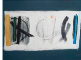
Title: Elegy Date: 2003 Medium: Acrylic on Canvas