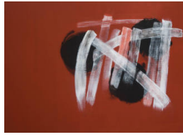
Title: Gaia Series (Mars) I Date: 2000 Medium: Acrylic and Oil on Canvas