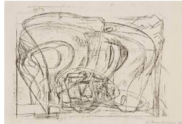
Title: Glacier Drawing Date: 1950 Medium: Off-set Drawing on Paper