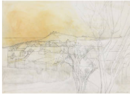
Title: St Ives from Salubrious House Date: 1968 Medium: Pencil and Oil on Paper