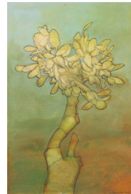
Title: Cactus Tree Date: 1955 Medium: Oil and Pencil on Paper