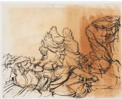
Title: Rocks, Formentera Date: 1958 Medium: Pen, Ink and Wash on Paper