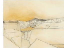
Title: St Ives No. 3 Date: 1984-1985 Medium: Charcoal, Oil and Conte on Paper