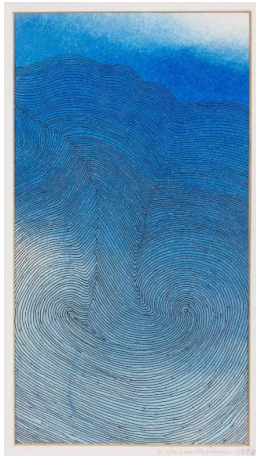
Title: Surge Date: 1978 Medium: Mixed Media on Card