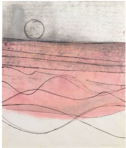
Title: Line Series with Circle Date: 1975 Medium: Mixed Media on Paper