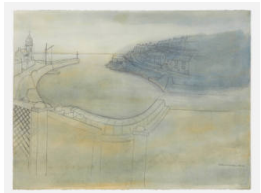
Title: Porthleven Date: 1951-1986 Medium: Gouache and Pencil on Paper