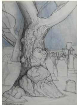
Title: Old Oak Tree (St Andrews Cathedral Series) Date: 1979-85 Medium: Pencil and Crayon on Board