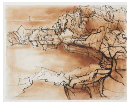
Title: Formentera Date: 1958 Medium: Pen, Ink and Wash on Paper