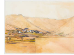
Title: Arrieta (Tabayesco) Date: 1989 Medium: Pencil and Acrylic on Paper