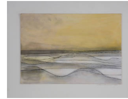
Title: Line Series Date: 1983 Medium: Mixed Media on Hardboard