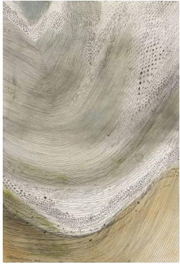
Title: Sea Sound No. 9 Date: 1980 Medium: Mixed Media on Hardboard