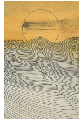
Title: Linear Movement and Circle 2 Date: 1982 Medium: Pen, Ink and Oil on Card