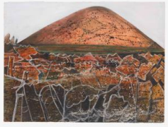
Title: Volcanic Island Lanzarote near La Geria No. 2 Date: 1989 Medium: Acrylic on Paper