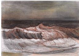
Title: Breaker (After Turner) Date: 1976 Medium: Mixed Media on Paper