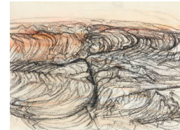
Title: Lava Forms Date: 1993 Medium: Pastel and Wash on Paper