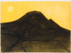
Title: Black Silence I, Maguez (Yellow) Date: 1990 Medium: Gouache on Paper