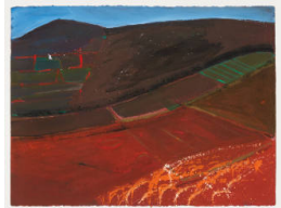
Title: Lanzarote Series Date: 1991 Medium: Gouache on Paper