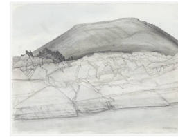
Title: Ruta de Los Volcanes, Lanzarote Date: 1989 Medium: Pencil and Wash on Paper