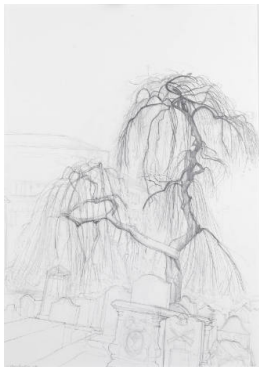
Title: Weeping Ash, The Hauff, Dundee Date: 1980 Medium: Pencil on Card