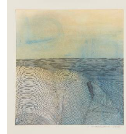
Title: Formation 1 Date: 1978 Medium: Mixed Media on Card