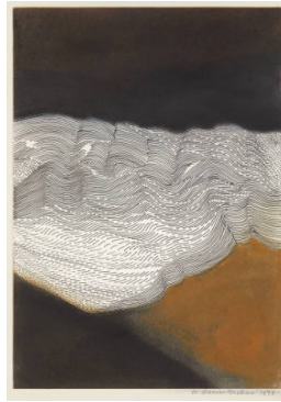
Title: Snow Shelf, Fife Date: 1978 Medium: Mixed Media and Board