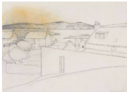
Title: Stromness, Orkney No.1 Date: 1985 Medium: Pencil and Oil on Paper