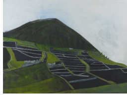
Title: Lanzarote Series Date: 1990 Medium: Acrylic on Paper