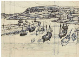
Title: St Ives from the Gap Date: 1950 Medium: Pen and Ink on Paper