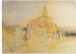
Title: St Monans Date: 1982 Medium: Pencil and Oil on Paper