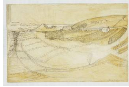
Title: St Martins Lower Town I Date: 1951 Medium: Pencil and Oil on Hardboard