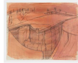
Title: Monte Olivetti, Tuscany Date: 1954 Medium: Pencil and Tempera on Paper