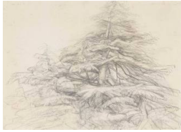
Title: Deodar Tree Date: 1980 Medium: Pencil on Paper