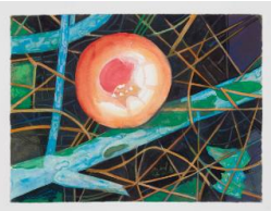
Title: Mushroom Series No. 7 Date: 1991 Medium: Gouache on Paper