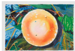
Title: Mushroom Series No. 8 Date: 1991 Medium: Gouache on Paper