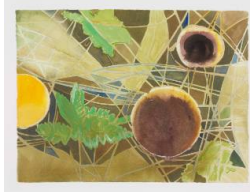
Title: Mushroom Series No. 6 Date: 1991 Medium: Gouache on Paper