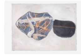
Title: 2 Gwithian Stones (Orange and Brown Line) Date: 1989 Medium: Acrylic on Paper