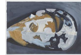
Title: Mussel Series No. 4 Date: 1990 Medium: Acrylic on Paper