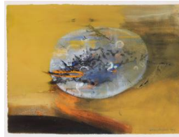
Title: Jelly Fish Series No.2 Date: 1989 Medium: Gouache on Paper