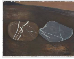
Title: Two Stones from Gwithian Date: 1988 Medium: Acrylic on Paper