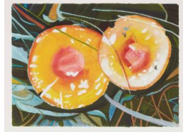
Title: Mushroom Series No. 10 Date: 1991 Medium: Gouache on Paper