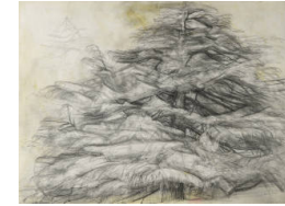
Title: Deodar Tree I Date: 1980 Medium: Pencil on Paper