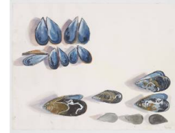
Title: Mussel Studies (Lanzarote) Date: 1990 Medium: Acrylic on Paper