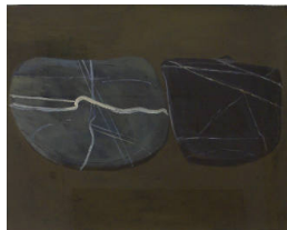
Title: Two Stones (Gwithian) Date: 1989 Medium: Acrylic on Paper