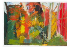
Title: Autumn Series No.8 Balmungo Date: 1999 Medium: Acrylic on Paper