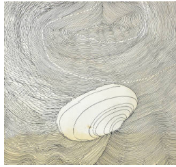
Title: Shell Date: 1979 Medium: Mixed Media on Card