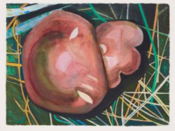
Title: Mushroom Series No. 9 Date: 1991 Medium: Gouache on Paper