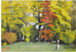
Title: Balmungo Garden Autumn Date: c1981 Medium: Oil on Canvas