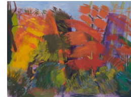
Title: Autumn Series No.7 Balmungo Date: 1998 Medium: Acrylic on Paper