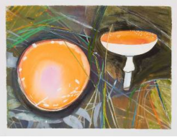
Title: Mushroom Series No. 3 Date: 1991 Medium: Gouache on Paper