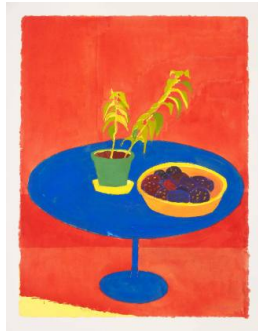
Title: Pink Lily and Passion Fruit Date: 1995 Medium: Gouache and Paper