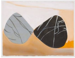
Title: Two Stones from Gwithian III Date: 1988 Medium: Acrylic on Paper