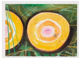
Title: Mushroom Series No. 2 Date: 1991 Medium: Gouache on Paper