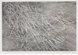
Title: Hailstorm Porthmeor Date: 1976 Medium: Pen and Ink on Board