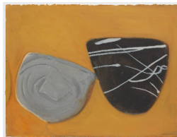
Title: Two Stones Grey and Black on Ochre Date: 1988 Medium: Acrylic on Paper