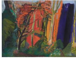
Title: Autumn Series No.5 Balmungo Date: 1998 Medium: Acrylic on Paper