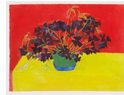
Title: Oxalis Triangularis Date: 1992-95 Medium: Gouache on Paper