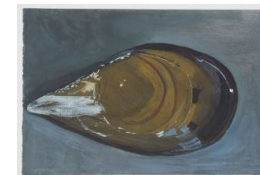
Title: Mussel Series No. 3 Date: 1990 Medium: Acrylic on Paper