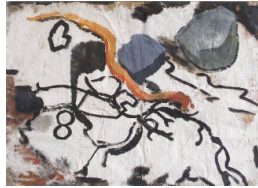
Title: Froth and Seaweed Date: 1945 Medium: Oil on Paper