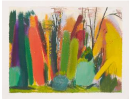
Title: Autumn Series No.4 Balmungo Date: 1998 Medium: Acrylic on Paper