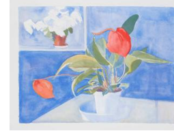
Title: Flamingo No. 2 Date: 1991 Medium: Gouache on Paper