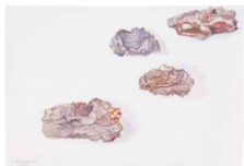
Title: Studies from Fir Barks Date: 1990 Medium: Watercolour on Paper