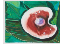
Title: Mushroom Series No. 1 Date: 1991 Medium: Gouache on Paper