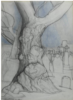
Title: Old Oak Tree (St Andrews Cathedral Series) Date: 1979-85 Medium: Pencil and Crayon on Board