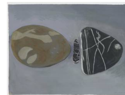
Title: Three Stones No. 3 Date: 1988 Medium: Acrylic on Paper