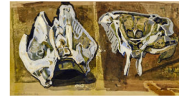
Title: Two Studies of a Horse's Skull Date: 1949 Medium: Monotype and Gouache on Paper