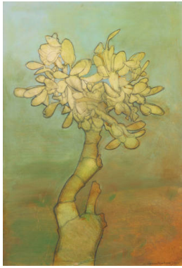
Title: Cactus Tree Date: 1955 Medium: Oil and Pencil on Paper