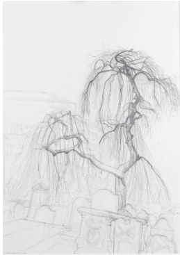
Title: Weeping Ash, The Hauff, Dundee Date: 1980 Medium: Pencil on Card