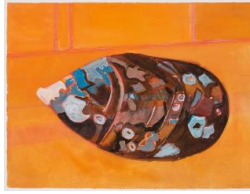
Title: St Ives (Mussel Series) Date: 1990 Medium: Gouache on Paper