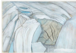
Title: End of the Glacier Upper Grindelwald Date: 1949 Medium: Gouache and Pencil on Paper