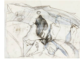
Title: Glacier Study with Guide Cutting Steps Date: 1949 Medium: Off-set Drawing and Wash on Paper