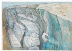
Title: [Glacier study] Date: 1949 Medium: Mixed Media on Paper