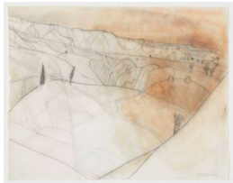
Title: Evening, July [11th July, Chiusure] Date: 1954 Medium: Pencil and Tempera on Paper