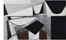
Title: Composition (Sea) Date: 1954 Medium: Oil on Canvas