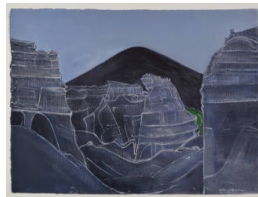
Title: Quarry Nr Teseguite, Lanzarote Date: 1989 Medium: Acrylic on Paper