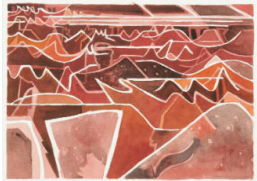
Title: White on Red (La Geria) Date: 1990 Medium: Gouache on Paper