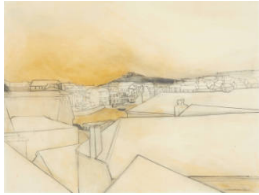
Title: St Ives No. 3 Date: 1984-1985 Medium: Charcoal, Oil and Conte on Paper