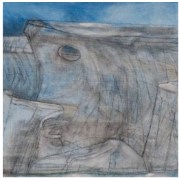
Title: Untitled Date: 1994 Medium: Oil on Canvas