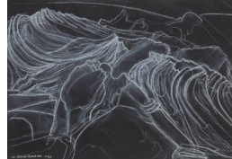
Title: Lava Forms Lanzarote 1 Date: 1993 Medium: Chalk on Black Paper