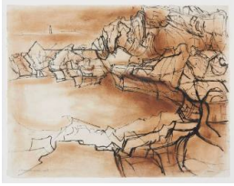
Title: Formentera Date: 1958 Medium: Pen, Ink and Wash on Paper