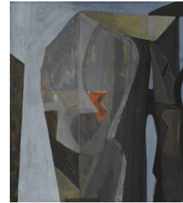
Title: Cliff Face Date: 1952 Medium: Oil on Canvas