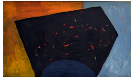
Title: Black Form on Orange and Blue Date: 1953 Medium: Gouache on Paper