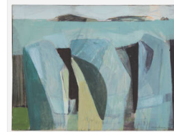
Title: Three Rock Forms Date: 1951 Medium: Oil on Canvas