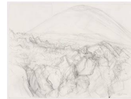
Title: Volcanic Island (near Montana del Fuego) Date: 1989 Medium: Pencil on Paper