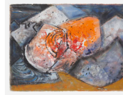
Title: Lanzarote Date: 1992 Medium: Acrylic and Volcanic Dust on Paper