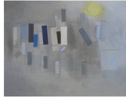
Title: Untitled Painted Relief No. 34 Date: 1985 Medium: Oil on Card on Hardboard