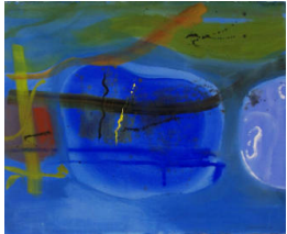
Title: Shallow Water, Porthgwarra No. 2 Date: 1989 Medium: Gouache on Paper