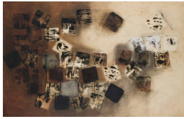
Title: Cork on Sand Date: 1963 Medium: Oil on Hardboard