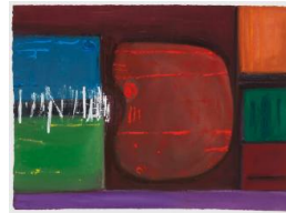
Title: Lanzarote, Red/ No. 2 Date: 1990 Medium: Gouache on Paper