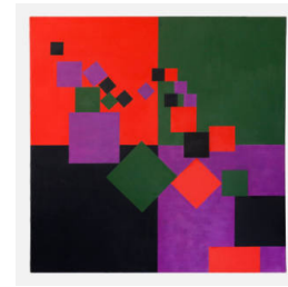
Title: Ascending Squares of Equal Amount Date: 1970 Medium: Oil on Canvas