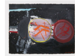
Title: January No.8 Date: 1992 Medium: Gouache on Paper