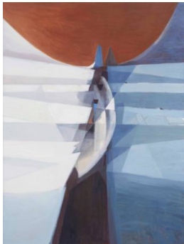
Title: Chasm Date: 1980 Medium: Oil on Canvas