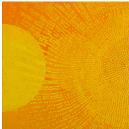
Title: Meditation East No. 4, 1968 Date: 1968 Medium: Oil and Acrylic on Hardboard