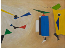
Title: Summer Painting No. 2 Date: 1985 Medium: Oil on Canvas