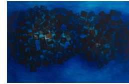
Title: Dance of the Thermals Date: 1964 Medium: Oil on Hardboard