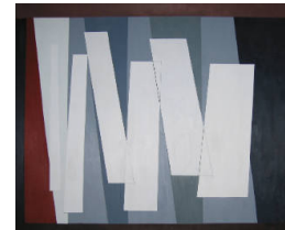
Title: Expanding White Panels Date: 1980 Medium: Oil on Hardboard