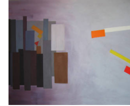
Title: Untitled (February Challenge No. 2) Date: 1987 Medium: Acrylic and Oil on Canvas