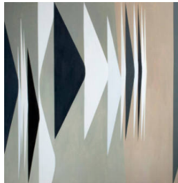
Title: Expanding Forms Black and White Date: 1980 Medium: Oil on Canvas