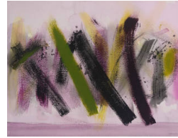
Title: Scorpio Series 3, No.6 Date: 1997 Medium: Acrylic on Paper