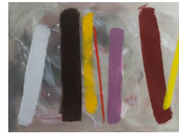
Title: Scorpio Series II, No.3 Date: 1996 Medium: Acrylic on Paper