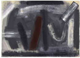
Title: Scorpio Series II, No.28 Date: 1996-1997 Medium: Acrylic on Paper