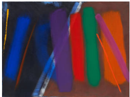
Title: Scorpio Series II 66/96 Date: 1996 Medium: Oil on Canvas