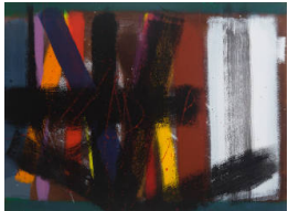
Title: Scorpio Series II, No. 18 Date: 1996 Medium: Acrylic on Paper