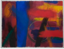
Title: Night Walk (Porthmeor No.5) Date: 1999 Medium: Acrylic on Paper