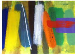
Title: Scorpio Series II, No. 6 Date: 1996 Medium: Acrylic on Paper