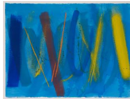
Title: Untitled, 57/00 Date: 2000