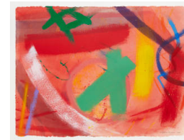
Title: Millennium Celebration Date: 2000 Medium: Acrylic on Paper