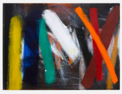
Title: Scorpio Series No. 1 Date: 1995 Medium: Acrylic on Paper