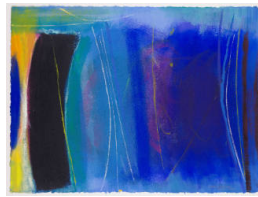
Title: Ocean III Date: 2000 Medium: Acrylic on Paper