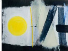
Title: Lemon Yellow Date: 1999 Medium: Acrylic on Paper