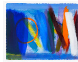
Title: Scorpio Series 3, No. 9 Date: 1997 Medium: Acrylic on Paper