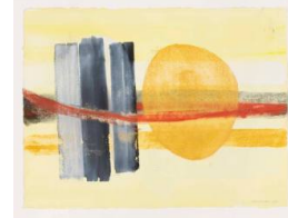
Title: Three Uprights and Circle No.III Date: 1995 Medium: Gouache on Paper