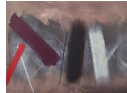
Title: Scorpio Series II, No.27 Date: 1996 Medium: Acrylic on Paper