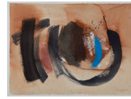
Title: Untitled (April) Date: 2001 Medium: Acrylic on Paper