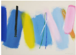
Title: Scorpio Series II, No.34 Date: 1997 Medium: Acrylic on Paper