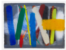
Title: Scorpio Series 2, No. 9 Date: 1996 Medium: Acrylic on Paper