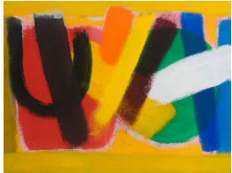
Title: Scorpio Series 3, No. 1 Date: 1997 Medium: Acrylic on Paper