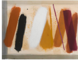
Title: Scorpio Series 2, No. 47 Date: 1997 Medium: Acrylic on Paper