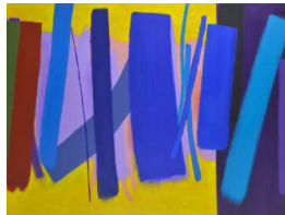
Title: Five Blues Date: 2000 Medium: Acrylic on Canvas