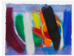
Title: Scorpio Series 3, No. 15 Date: 1997 Medium: Acrylic on Paper