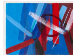
Title: Surprise Series No. 3 Date: 1998 Medium: Acrylic on Paper