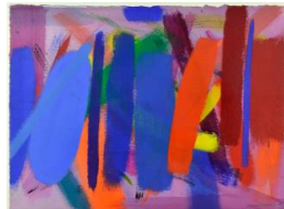
Title: Blue Dance Date: 1998 Medium: Acrylic on Paper