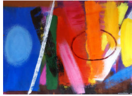
Title: Untitled, 05/99 (RSW 2000) Date: 1999 Medium: Acrylic on Paper